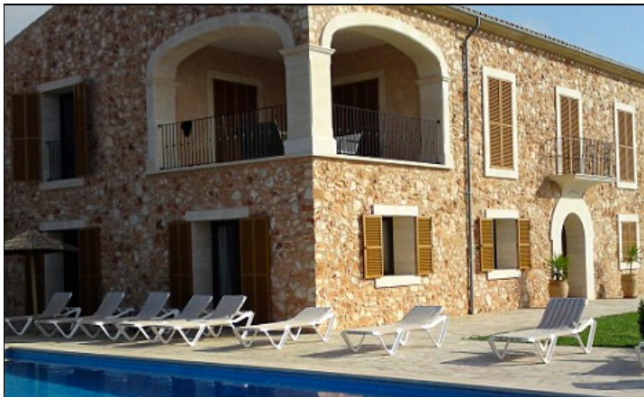
Elegant: Mansion Ses Oliveres has six bedrooms, pool, grounds and internet connection.

After docking at Palma, we were taken on a seemingly endless coach journey across the island to visit the Drach caves at Porto Cristo. The caves were the usual bore. Never, ever visit caves, especially on an organised excursion. More impressive was the obvious rank poverty of Majorca.